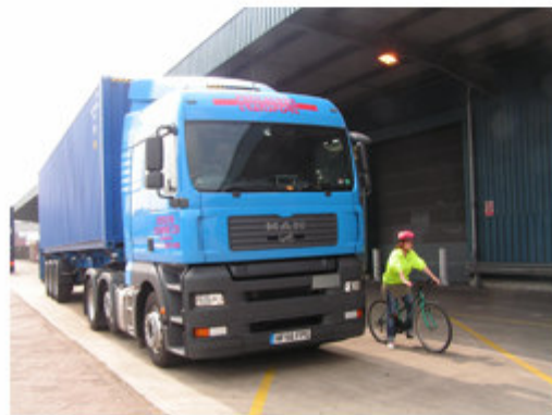
Cyclist situated in the Blind-Spot

The lens that eliminates the HGV passenger-side Blind-Spot